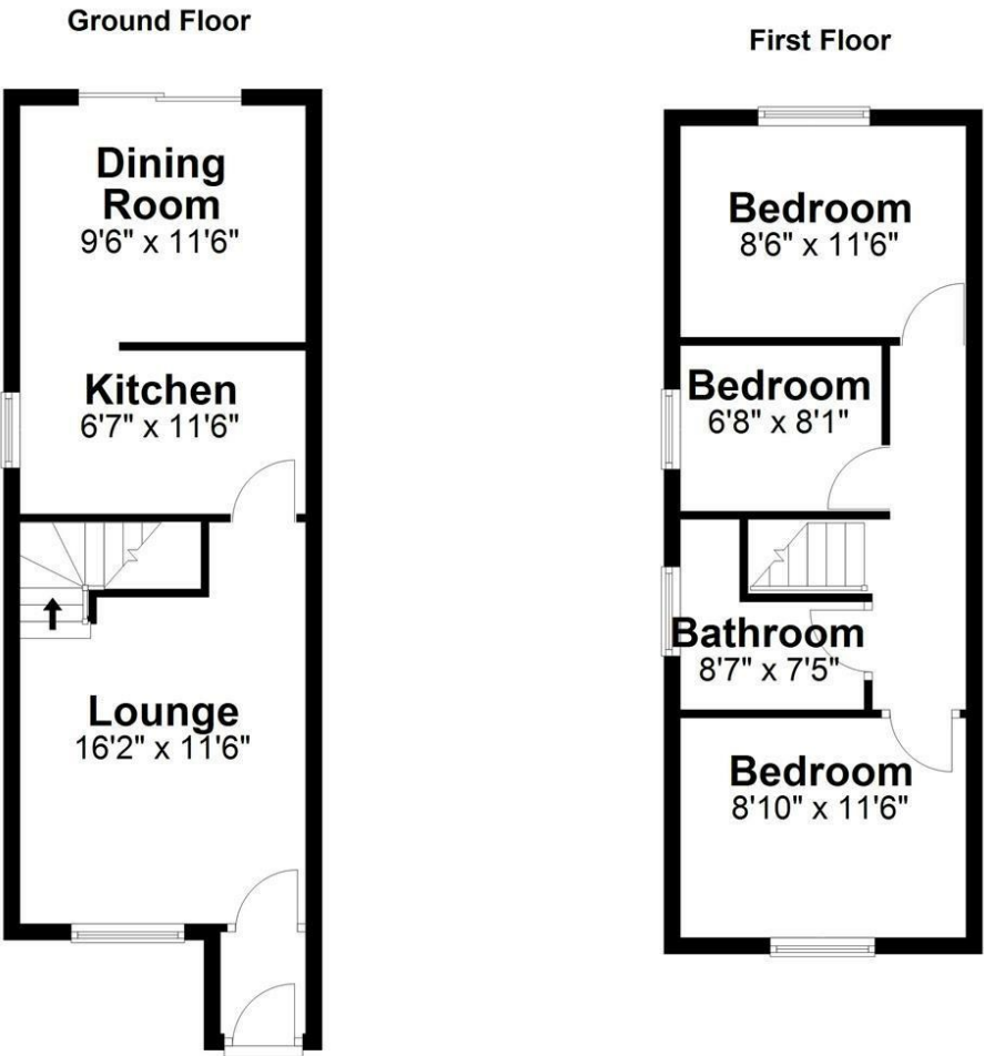
Total area: approx. 765.1 sq. feet Norman Drive, Mirfield

These particulars, whilst believed to be accurate are set out as a general outline only for guidance and do not constitute any part of an offer or contract. Intending purchasers should not rely on them as statements of representation of fact, but must satisfy themselves by inspection or otherwise as to their accuracy. No person in this firms employment has the authority to make or give any representation or warranty in respect of the property.